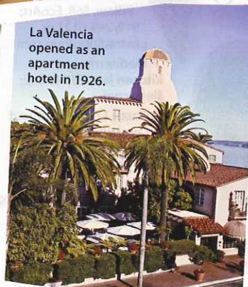
La Valencia opened as an apartment hotel in 1926.