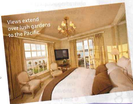
Views extend over lush gardens to the Pacific.

When to go: Whenever you can! Weather's mostly wonderful year-round. Rooms from $275; 800/451-0772 or lavalencia.com