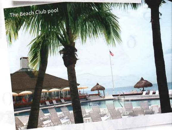
The Beach Club pool

CLOCKWISE FROM TOP LEFT: COURTESY OF BLACK POINT INN, GASPARILLA INN & CLUB, AND LA VALENCIA