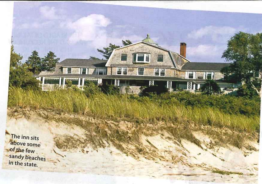
The inn sits above some of the few sandy beaches in the state.